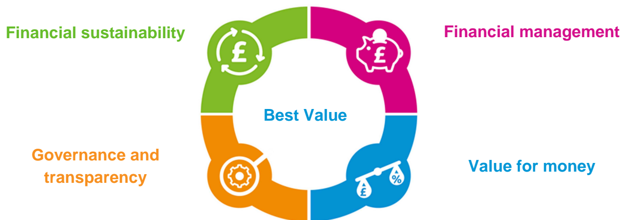
Exhibit 1: Audit Dimensions within the Code of Audit Practice